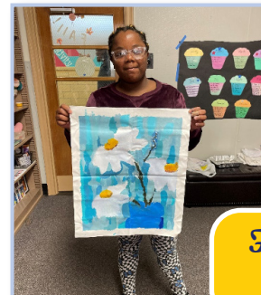
Featured Artist of the Month