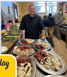
Yummy Holiday Desserts